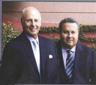
Girardi | Keese