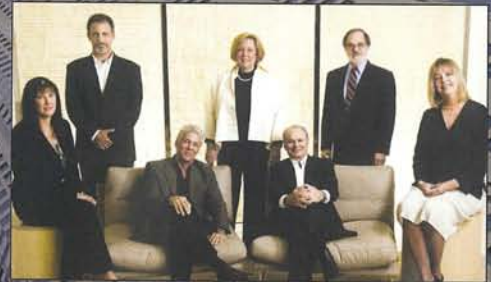
Dreier Stein & Kahan