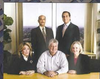
Katten Muchin Rosenman