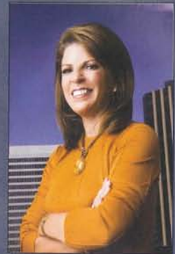
Phillips, Lerner, Lauzon & Jamra