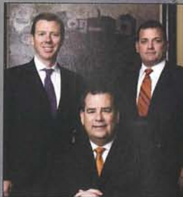
Panish, Shea & Boyle