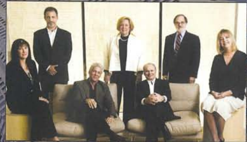
Dreier Stein & Kahan