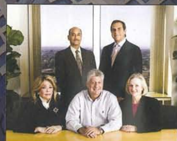
Katten Muchin Rosenman